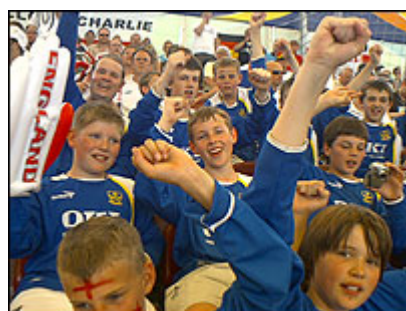
At the stadium in Stuttgart

When we headed for the stadium it really began to kick in that this was the World Cup. The atmosphere was amazing - we had our Pompey tops on and were doing our Pompey and England chants. We were sitting behind one of the goals - it was the opposite end to the goal which Beckham scored in but we could see just how it curled and swung round into the goal.