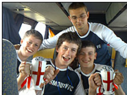
Back on the coach

restricted but still we are all having fun.