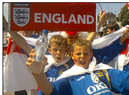
Mayville boys in Stuttgart

You are in: Hampshire > Sport > Features > Mayville's World Cup Adventure